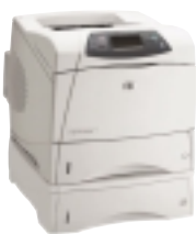
hp LaserJet 4200dtn and hp LaserJet 4300dtn