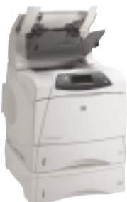
hp LaserJet 4200dtnsl and hp LaserJet 4300dtnsl

For business users in enterprise, large, medium and small organisations the HP LaserJet 4200 and HP LaserJet 4300 series offer reliable HP LaserJet performance, unrivalled versatility and an easy to use and manage solution which meets the high printing demands of workgroups of 5-15 users.