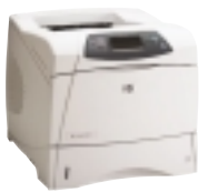
hp LaserJet 4200/n and hp LaserJet 4300/n

Exceed workgroup expectations with the HP LaserJet 4200 and HP LaserJet 4300 series' consistently high performance and print quality. Intelligent, versatile and reliable, these monochrome printers offer a wealth of features designed to make them easy to use and manage.