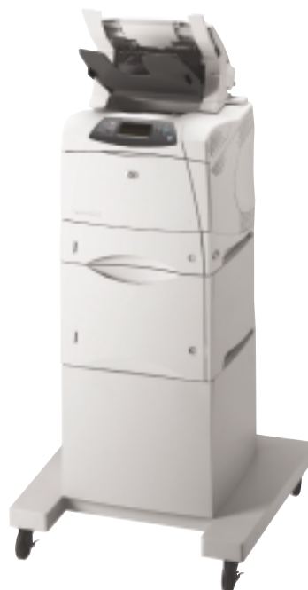
hp LaserJet 4200/4300 printer with additional accessories